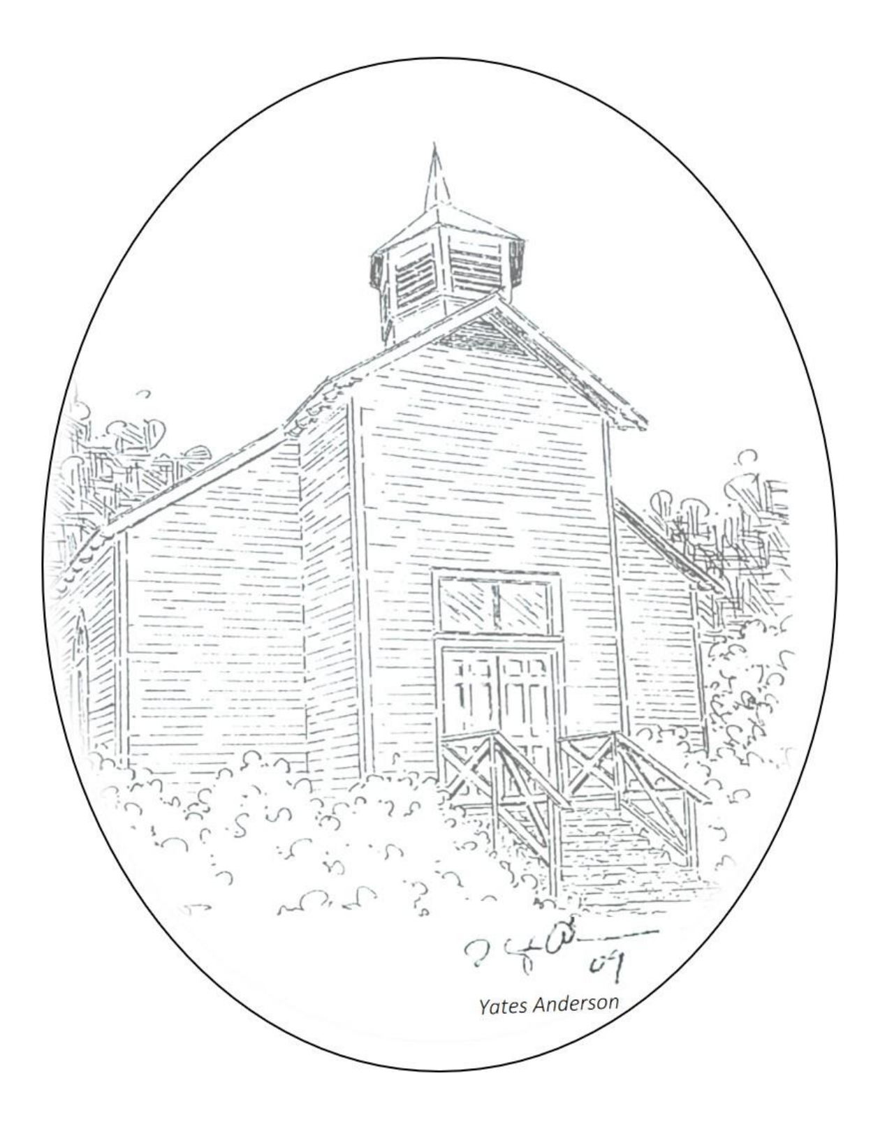
Lake Toxarvay United Methodist Church Sunday, April 25th, 2021